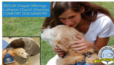
2023-24 Chapel Offerings Lutheran Church Charities COMFORT DOG MINISTRY

Cross Lutheran School collects weekly chapel offerings. This year our offerings are going to the Lutheran Church Charities-Comfort Dogs. LCC K-9 Comfort Dogs are working animals, trained to interact with people of all ages and circumstances who are suffering and in need. The dogs participate in scheduled and special events. Lutheran Church Charities currently has over 130 LCC K-9 Comfort Dogs serving in more than 27 states.